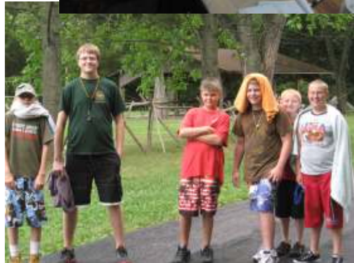
Scouts start check-in procedures in a light rain