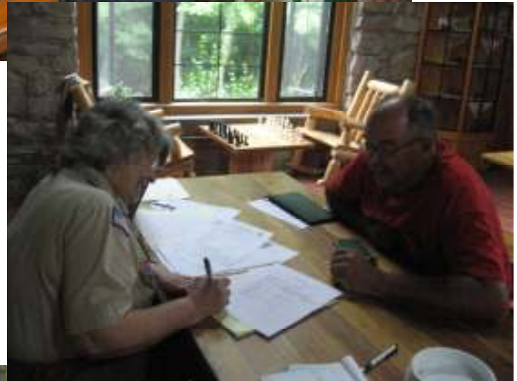
Leaders get to do the exciting financial procedures