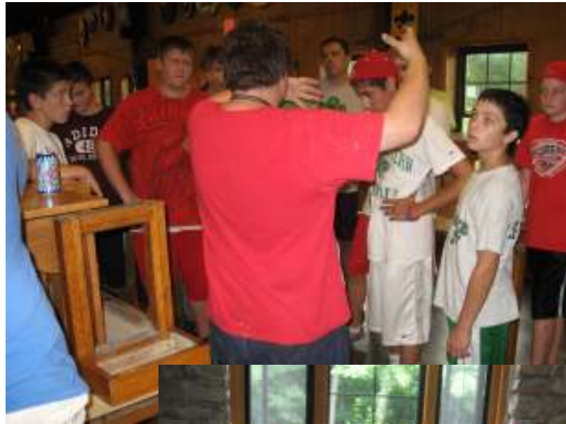
Cord explains the dining hall table waiter system

After check-ins, swim checks, and campsite setups were finished, scouts were treated to dinner in the dining hall. Following the meal, the traditional Sunday night campfire welcomed all to what will surely be a fun-filled week. During the campfire, Order of the Arrow callout ceremonies for Blackhawk Lodge were held.