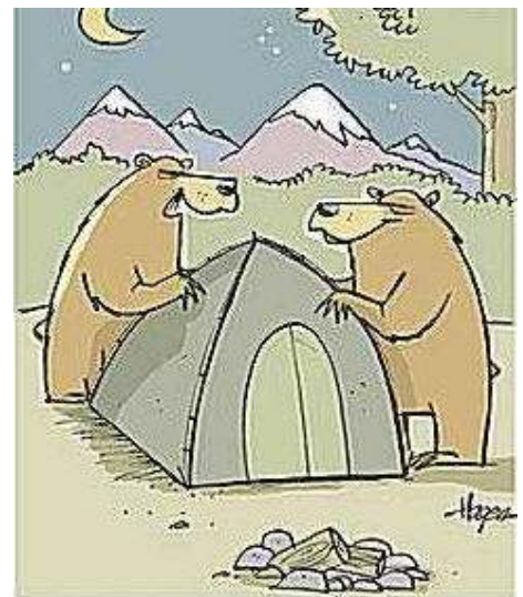
I JUST LOVE HOW THEY COME INDIVIDUALLY WRAPPED TO SEAL IN THE FLAVOR!

Because their duties require them to be elsewhere at two o'clock, Camp Eastman staff members are invited to a sneak preview sale. Staff members can stop by the Flea Market anytime after lunch to browse and buy the merchandise.