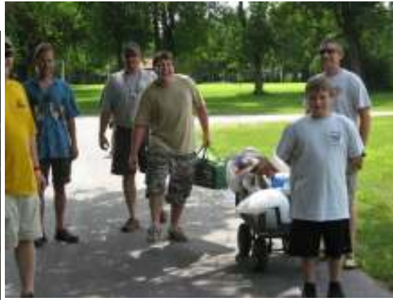
A late arrival gets plenty of help moving in