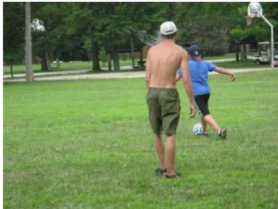
Troop 119 has a quick pick up game of soccer