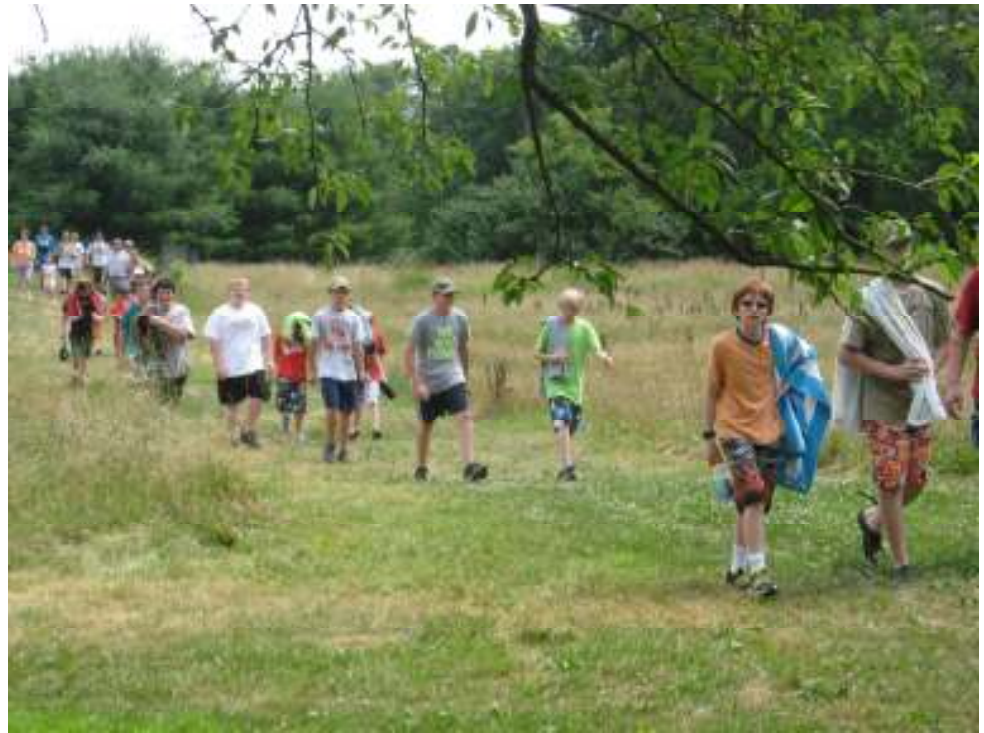
Troop 43 marches in from Redwing campsite for their swim checks