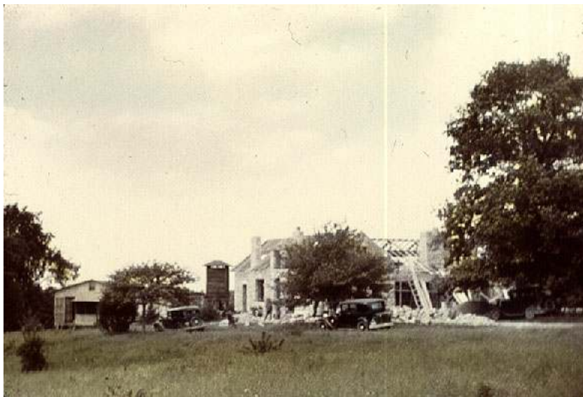
The Great Oak (far right) overlooks the construction of Eastman Lodge in 1935