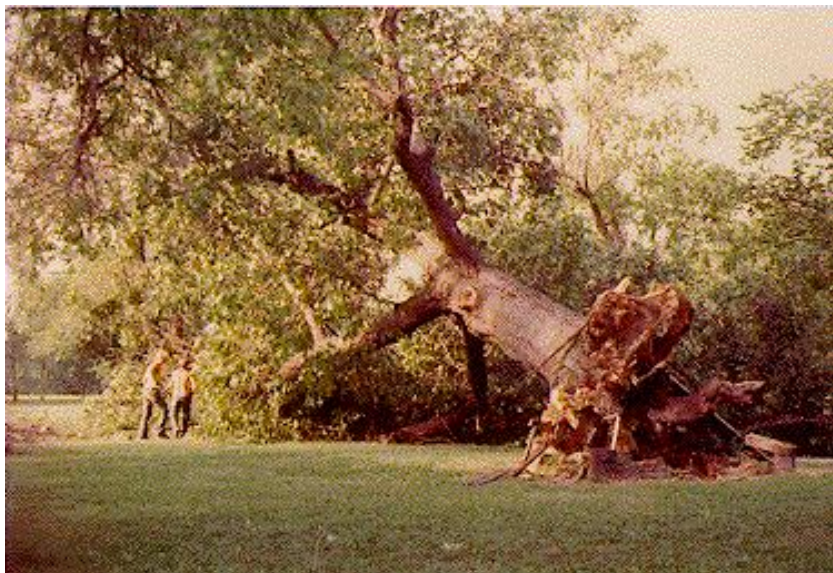
Two scouts appear tiny as they inspect the fallen oak tree

I am glad I had the chance to see the Oak before it fell, but future generations will have to rely on photographs and stories of Camp Eastman's oldest landmark.”