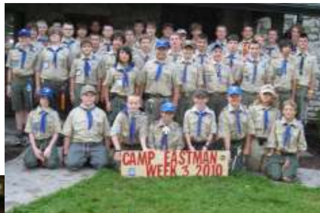
Left: Scouts of Troop 708

Below: Scouts learn their knots on The back porch of Eastman Lodge