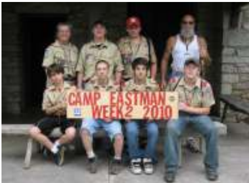
Troops pose for their photos: Left Troop 31 Right Troop 30

After a quick walk to W.O. Peterson Ring the campfire will begin. Troops will have a chance to perform skits for their visiting families, and the Staff is sure to provide plenty of entertainment. Later, the Tribe of the Silver Tomahawk Honor Society will perform their Call Out ceremony, giving several outstanding campers the opportunity to join their ranks.